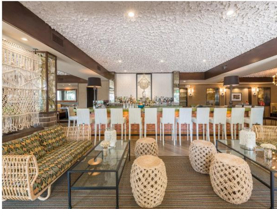
The Front Yard, North Hollywood. | The Garland